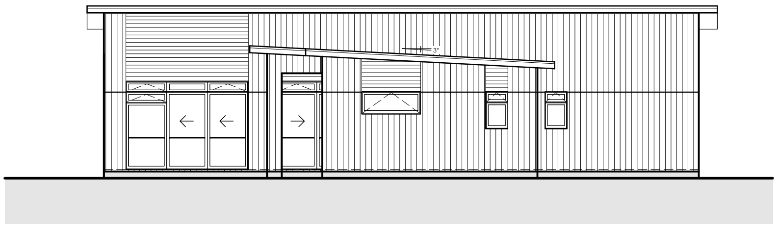
Elevation 0 - 3 scale 1:100